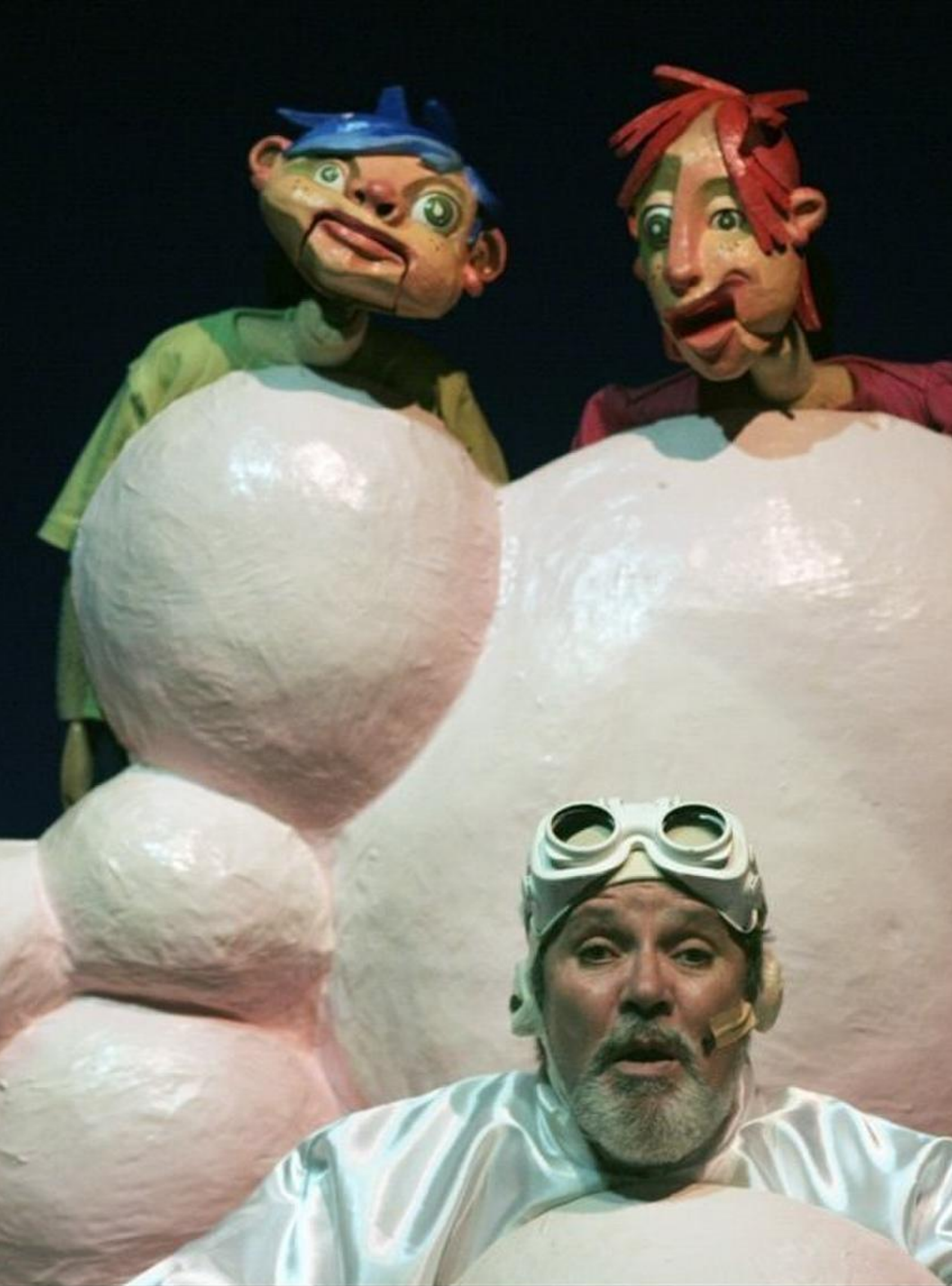
· ANDAR NAS NUVENS · Fotografia de Eduardo Arau