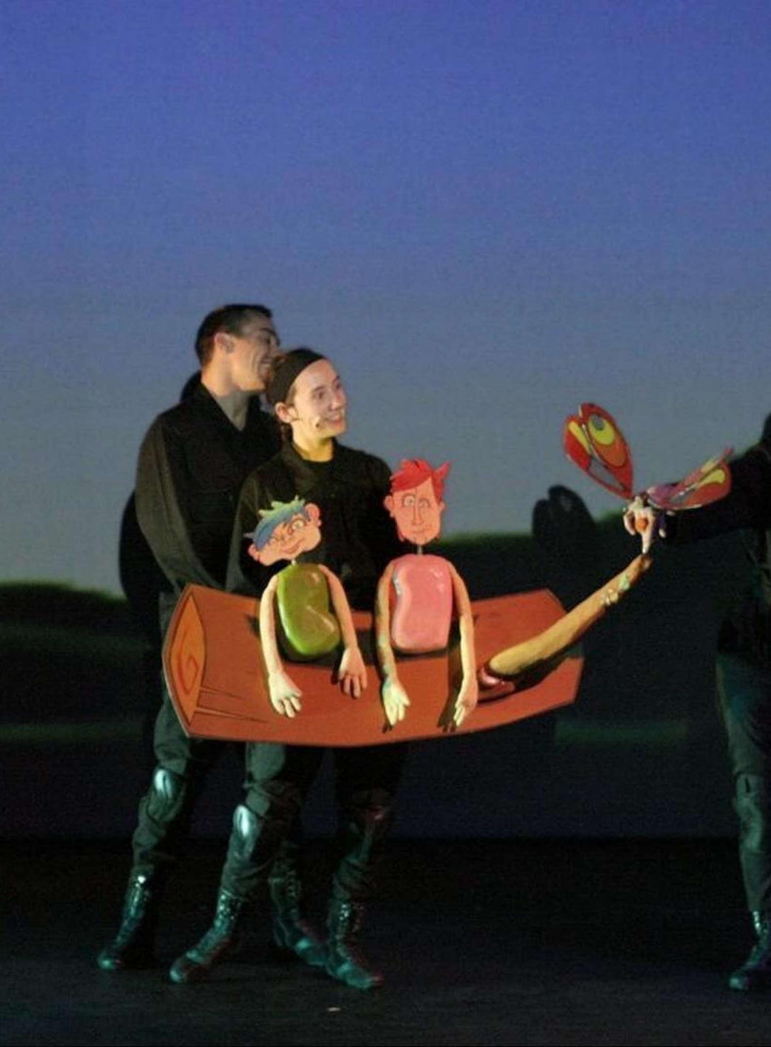
• ANDAR NAS NUVENS •