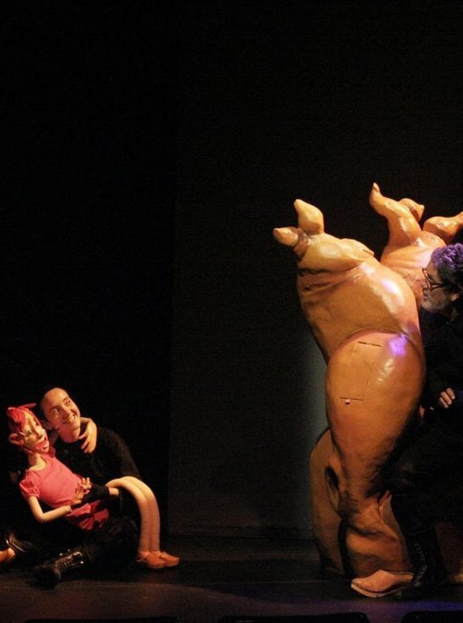
T · ANDAR NAS NUVENS