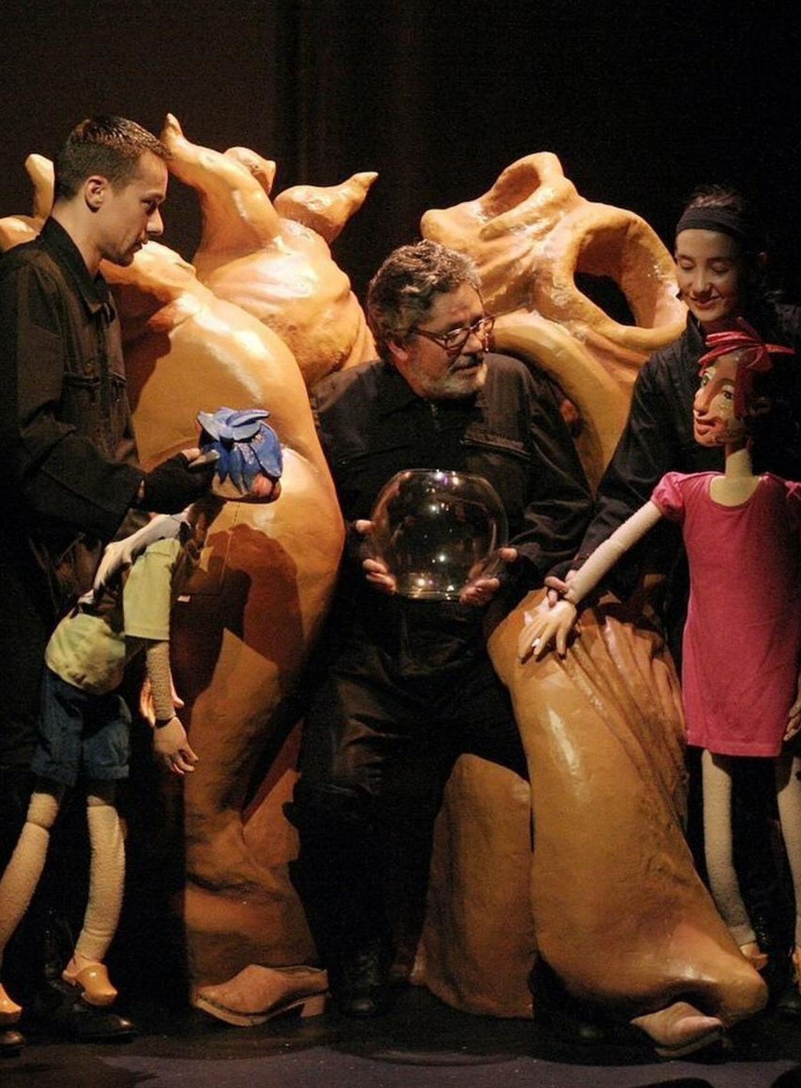
CERT · ANDAR NAS NUVENS